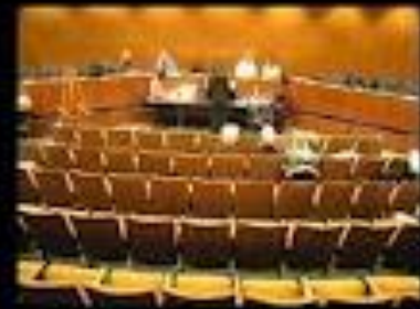
What I really do