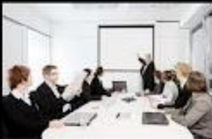
What the APA thinks I do