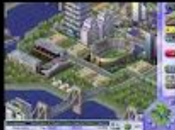
What my friends think I do