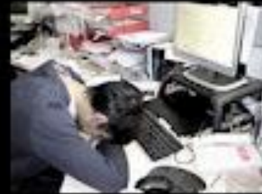
What applicants think I do